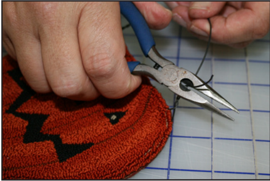
STEP 9: Attached a hanging wire, twisting each end through the punchneedle then around itself.