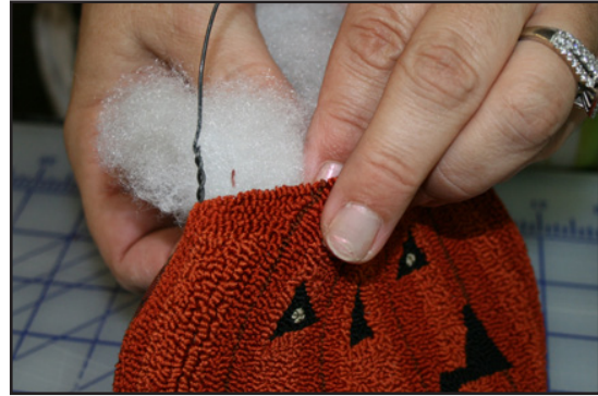
STEP 10: Fill bottom and sides with a small amount of fiber fill.