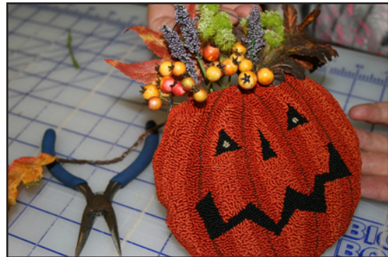
STEP 12: Fill with your favorite seasonal stems.