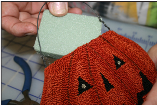
STEP 11: Place a small piece of floral foam inside.