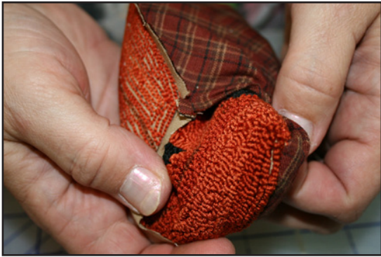
STEP 7: Turn right side out.